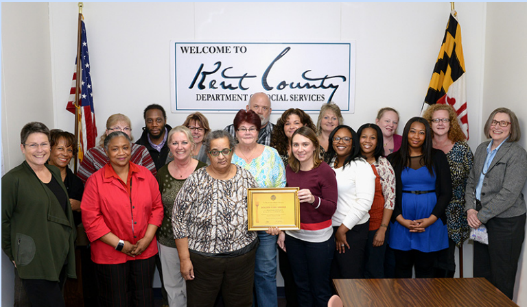
Family Investment Division receiving a Golden Fork Award